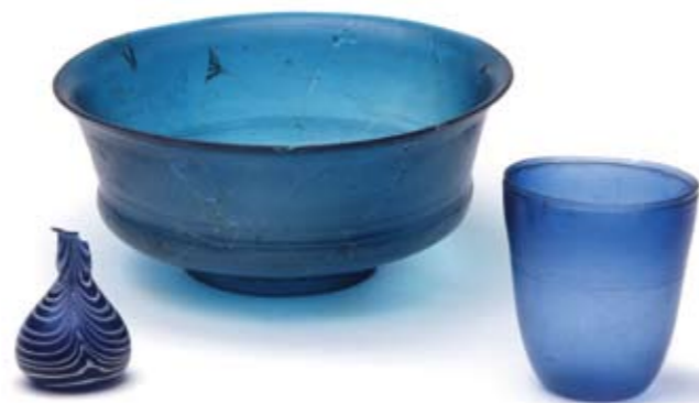
Verreries d'origine italienne provenant d'Antran (1 er siècle ap J.-C.)

Besides the walls of dwellings conserved on the spot, the sculptures discovered in and around the ancient city demonstrate the romanisation of Lemonum , the capital of the Pictons. Lifestyle, religion and funeral rites are explained through the display of monumental statuary, but also through objects of daily life. Dating from late antiquity, remains of the oldest Christian stucco relief found in Gaul, sculpted sarcophagi, jewellery, epitaphs, and sculptures from the Dunes hypogeum evoke the birth of Christian art in Poitou.