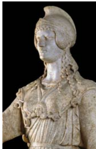
Athena (Minerva) - Marble, 1 st century A.D. ▶

Besides the walls of dwellings conserved on the spot, the sculptures discovered in and around the ancient city demonstrate the romanisation of Lemonum , the capital of the Pictons. Lifestyle, religion and funeral rites are explained through the display of monumental statuary, but also through objects of daily life. Dating from late antiquity, remains of the oldest Christian stucco relief found in Gaul, sculpted sarcophagi, jewellery, epitaphs, and sculptures from the Dunes hypogeum evoke the birth of Christian art in Poitou.