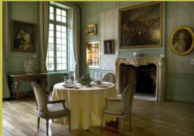
Vue intérieure du musée