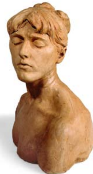
Camille Claudel, Woman with eyes closed (1885)

Important transformations programmed for 2008-2011 will allow for a better and new presentation of the museums rich art collection.