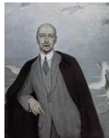
Romaine Brooks, Portrait of Paul Morand (1925)

Works on the threshold of the 20 th century show the passage to modern art (Sisley, Bonnard, Vuillard, Mondrian). The 20 th century rooms display fine paintings from the 20s and 30s (Romaine Brooks, Marquet, Ducos de la Haille, Fautrier).