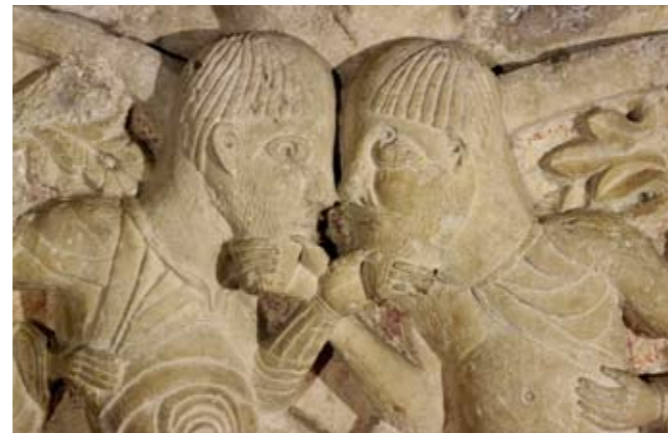
Sculpted capital, known as « the Quarrel » Limestone, 11 th century

On the ground level, the reliquary vase from the abbey of Saint-Savin-sur-Gartempe (an exceptionally rare glass piece unique in Europe) introduces the visitor to the Middle ages. Medieval sculptures, most of which come from now lost buildings, recall that Poitou was great center of Romanesque art. The sculpted capital of « the Quarrel » remains as a masterpiece of this period.